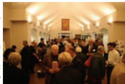
A large crowd fills the Walker Education Center in celebration of the official designation of the Huntsville Cultural District.