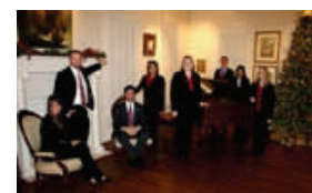
Junior Fellows Christmas Card, Wynne Home