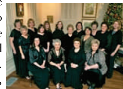
The Belle Chanson Choir

The group is all female, consisting of numerous SHSU alumni, many of whom are local choir directors.